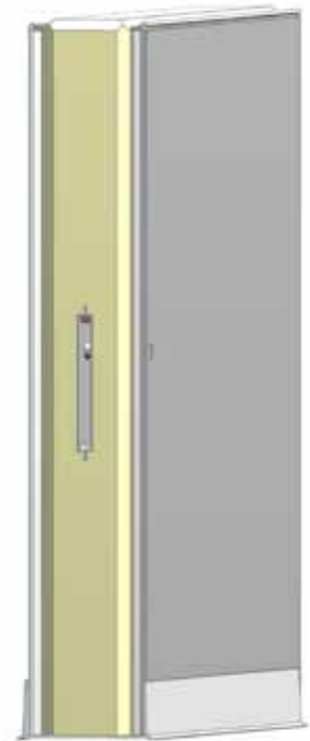
FLAT BOTTOM WALLS